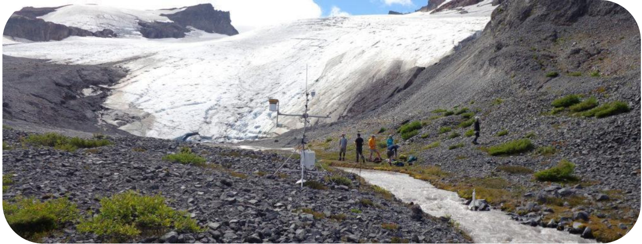
Sholes Glacier and stream gage station. We have constructed a rating curve for this station that the Nooksack Indian Tribe maintains (Grah and Beaulieu, 2013). This photo was taken below Sholes Glacier in 2015 and exhibits the darkening of the surface that occurs in high melt years, increasing melt rates.

This exposed the dirtier ice that lies underneath the snow and melts more rapidly than snow under the same weather conditions. The resulting higher melt rate led to increased discharge in glacier fed streams, while non-glacier fed streams in the region had significant declines in discharge.