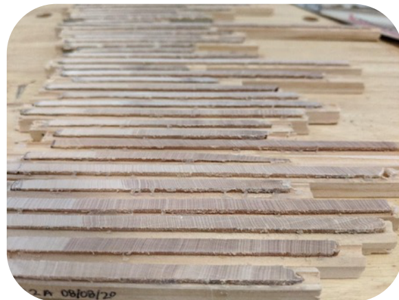
Mounted and surfaced Western Juniper ( Juniperus occidentalis ) tree core samples from the Frederick Butte, Oregon sample site.

Tree-ring chronologies provide precise, annually resolved, multi-century paleoclimate information which may enhance our knowledge of the natural long-term variability in the climate system, beyond the instrumental record (Fritts, 1971, 1976).