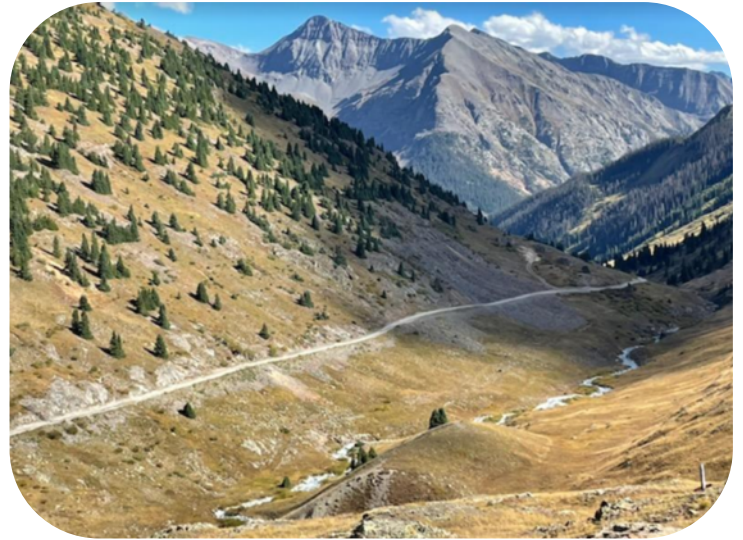
The landscape we are working in.

This really is a whole new world; tumbling hillslopes of golden grasses, wetlands of spongy moss, slopes of tumbled talus below dizzying peaks, burbling streams flowing with algae reminiscent of...maybe water nymph hair? It is mesmerizing to watch. There are rocks bristling with quartz crystals and hefty crickets that seem unafraid of our presence. Elk trails contour the landscape and the "squee" of pika prick the air frequently. The occasional crow has far too much fun soaring over their domain and laughing at our ground-bound human forms