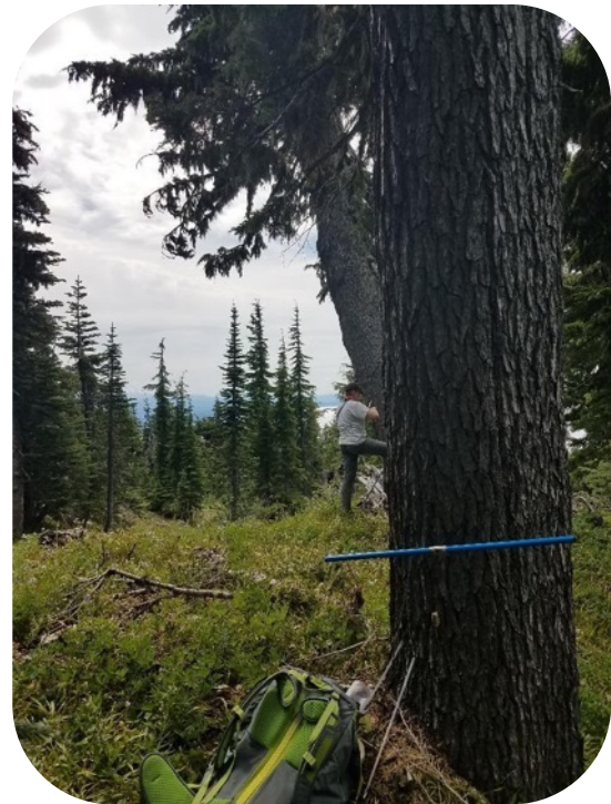
HYTRAC Lab MS student Inga Homfeld collecting a Mountain Hemlock ( Tsuga mertensiana ) tree core sample at the Mount Hood, Oregon sample site.

Cascade Range, USA. By examining the two reconstructions in tandem, I quantified and compared the magnitudes and durations of warm versus dry snow droughts over the past 155 years, relative to the observed period of record (1952-2018). As a check to ensure that these two proxy types are recording snow droughts in the way in which I hypothesize, I utilized Hatchett et al.’s phase diagram approach (2022), using the Western Regional Climate Center’s Snow Drought Tracker (WRCC, 2022). Drawing from select Natural Resource Conservation Service SNOTEL station’s snow water equivalent (SWE) and precipitation datasets, the phase diagram displays cool-season conditions, relative to the station’s period of record.