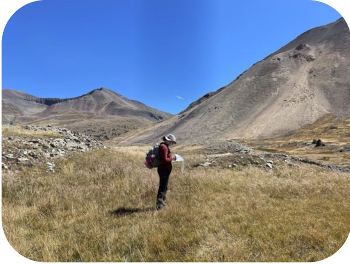
Recording observations of Burrows Basin.

pools dotting the wetlands at the bottom of the basin. Dissolved oxygen, pH, temperature, and mercury content are noted, and a water sample is taken from each site. These samples will be sent off to a lab for analysis. Soils are also collected in bags to be analyzed for heavy metal content. Vegetation greenness is assessed on site by measuring the light wavelength reflection of any given patch.