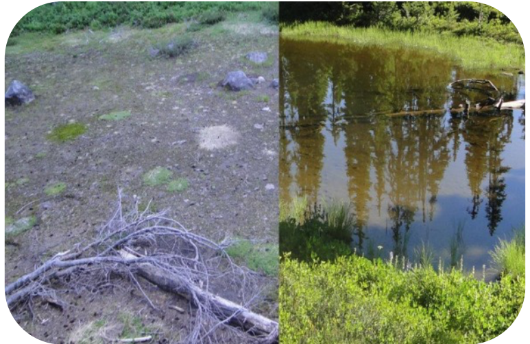
Around our Mount Daniel base camp are a dozen shallow ponds, 10-20 cm depth on average that typically last until tadpoles hatch in late August or early September, but they dried out in 2021. The primary inhabitants are frogs ( Rana cascades ) and their tadpoles. In 2022 despite a wet spring and early summer that filled the ponds (above, right) no tadpoles were observed, where typically there are several hundred.

The North Cascade Glacier Climate Project that we direct has for 39 years observed the response of North Cascade glaciers to climate change. In the last several years an increasing number of heat waves have affected alpine glacier regions in the Pacific Northwest, illustrating that heat waves and alpine glaciers are incompatible. The most extreme heat event in the Pacific Northwest occurred in late June 2021, setting all-time records across the region (Thompson et al, 2022). The heat wave and ensuing warmth