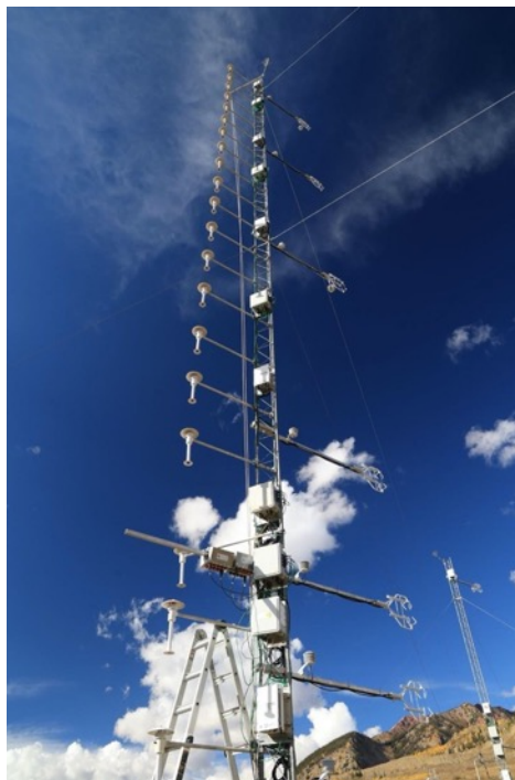
Figure 2. Looking up at the 20 m tower during October field deployment. On left, temperature and relative humidity sensors every 1 m, sonic anemometers (to measure air movement) at every 4 m.

Mott, R., Vionnet, V., & Grünewald, T. 2018. The seasonal snow cover dynamics: Review on wind-driven coupling processes. Frontiers in Earth Science , 6(197).