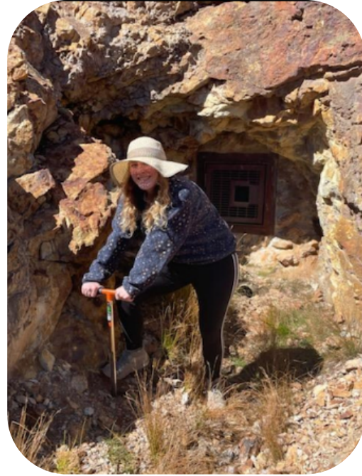
Taking soil samples outside a mine.

We counted almost 70 mine sites in a basin less than 1.5 square miles in area. In some places, tailing piles overlap each other creating great scars in their journey down the mountainside. Tailings piles are like big, tan meals that sit wrong in the stomach; gobbled up inner earth vomited on the surface of the land. They consist of sand and chunks of rock left over from the search for valuables. The minerals in them, which release slowly while underground, release much faster on the surface, leading to concentrations that can be toxic to the surrounding life and the humans that drink