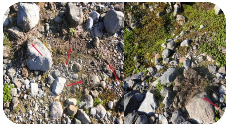
In 2021 below Easton Glacier we noted many alpine plants that had emerged just before or during the record June heat wave that were desiccated/cooked by the heat in this area of relatively barren volcanic rock, most notably lupine. This year in the same region we noted that ~30% of the lupine had failed to develop by August 2022, despite a cool wet spring. In contrast the evergreen alpine plants in the same area penstemon, saxifrage, pink and white heather, and partridge-foot were fine.

stripped the snow cover from glaciers right to the summit on the highest mountains, from Mount Shasta, California to Mount Baker, Washington — all by mid- August.