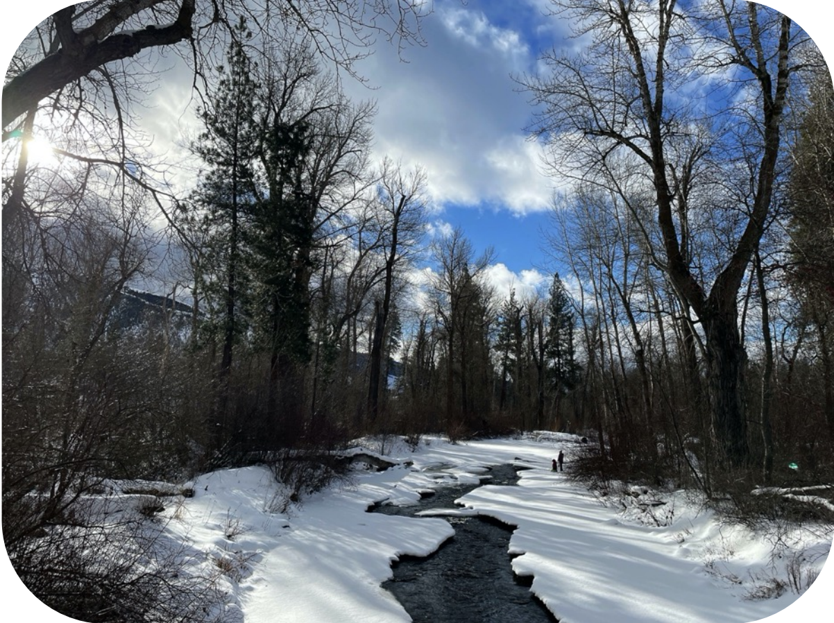
Back Cover Art: The Ice Watchers—Montana. Photograph taken on 11/2/2022 from the Greenough Park (Missoula, Montana), north end bridge. Artist: Joe Glassy