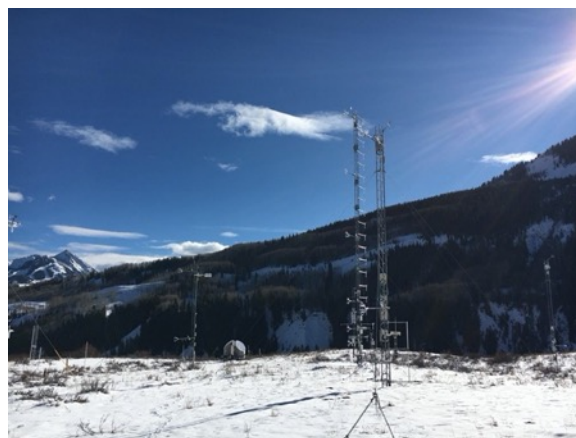
Figure 3. One of the 10 m towers with snow on the ground, Oct. 30, 2022.