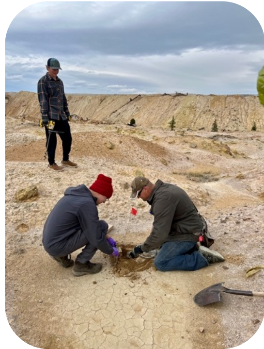
Montana Technological University Restoration Ecology Students installing soil moisture sensors at the Badger Mine waste site north of Butte, Montana (above). Badger Mine Site where volunteer trees are starting to populate the abandoned Badger Mine waste site (below).

At the Badger Mine site, we installed an array of soil temperature and moisture sensors at the tops of the mounds and in the swales concurrently with collections of soil samples for measurements of pH and metal concentrations, which will be measured with a handheld XRF analyzer. We anticipate collecting in-situ sensor data and mapping plants in spring 2023. These data will be used to investigate the influences of environmental conditions and metal content on colonization by pioneer plants of a mining-impacted area in the mountain west.